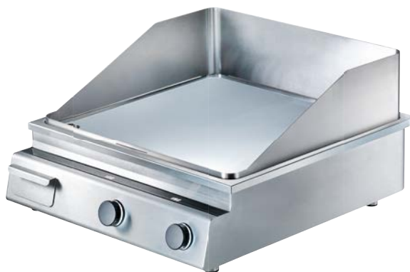
INSTINCT Griddle 10